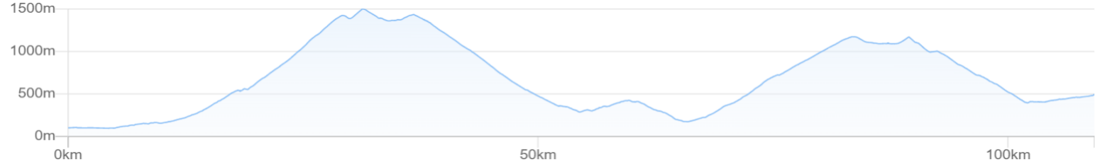
Lunch Akagi mt.(34km) Meigetsukan Treckers café Bandy Shiobara Soyama market