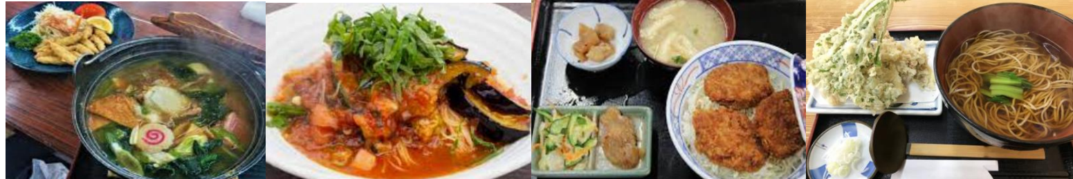
Shibukawa(66km) Nakashima soba noodle café Tonden Shibukawa Iccho Shibukawa Takako dining