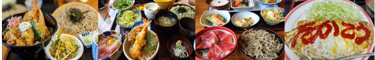
Iseya Takara restaurant Cafe & Dining Bar Vingtie Berny's Dyner Hamburg