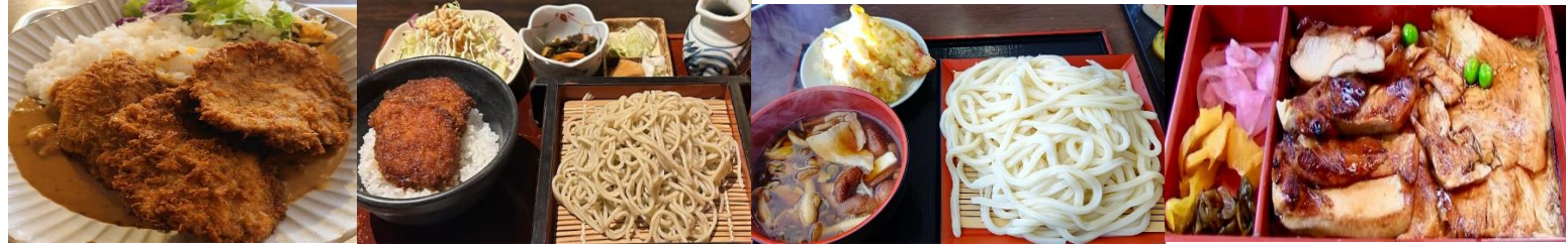
Tsurukichi Maebashi Joshu bar Torimiya local chicken grill Saikaya WA Minamimachi Italian doi