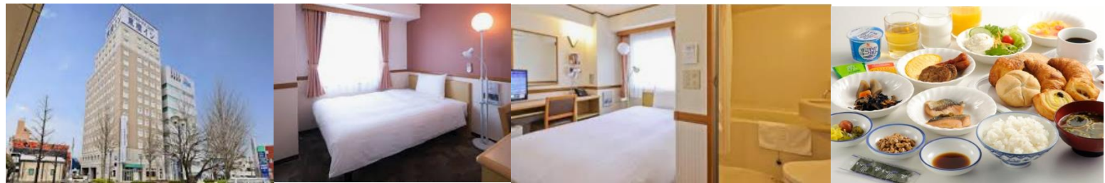
Pre stay outside bath Maebashi st. Natural spa Yu-Yu Pre stay meal Maebashi Seiyotei Ichi Magokoroan Sobahiro Nukui noodle Toribira Joshu chicken

Meet May 9th(Sat) 7:30 Toyoko inn Maebashi st. Maebashi city Minamicho3-9-1 TEL:027-223-1045