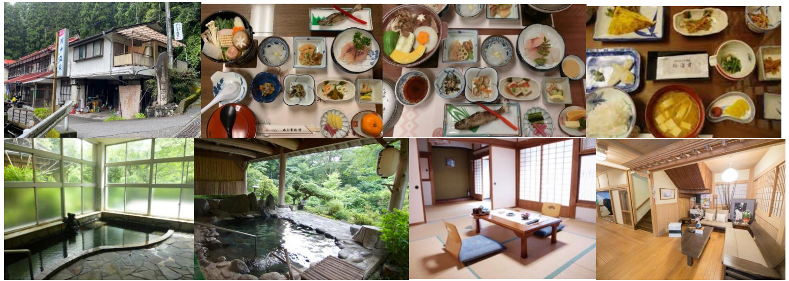
Other stay Matsunoyu onsen spa Shokeikan Fukudaya ryokan inn Kawayu onsen spa

2nd Kawanaka spa~Kenashi pass~Shibu pass~Yudanaka st. 103km+2723m