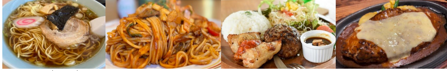
Harunasan mt.(83km) Haruna lake Fujiya Haruna lake rest house Romance tei dining Saikoon