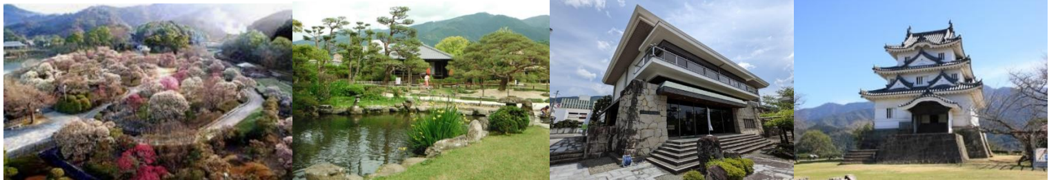
Stay Uwajima st. Super hotel naturalspa 〒798-0034 Ehime pref Uwajima city Nishikicho4-1 TEL:0895-22-9002