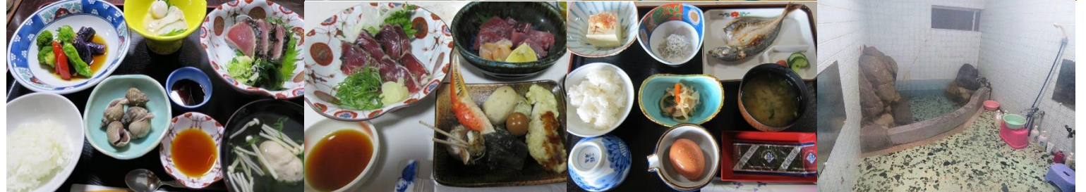
Outside bath Shiresu Muroto (1.6km from Minshuku Murosoto inn)