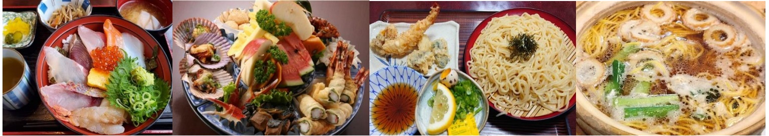
Kitchen Azzurri Donjaka Susaki Donjaka Susaki Ikkyudon Izakaya Chiaki