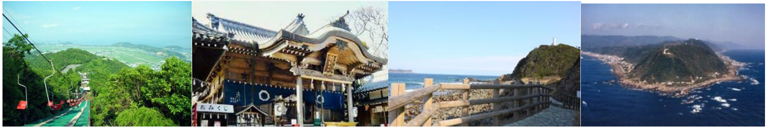
Stay Minshuku murosoto inn 〒781-7101 Kochi pref. Muroto city Murotomisakicho6939-1 TEL:0887-22-0409