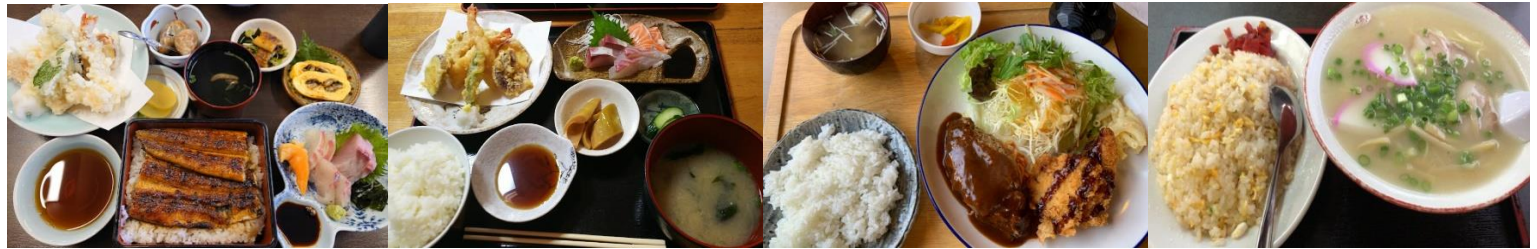
Iyo Saijo(74km) Kinoya Japanese seasonal dining Saijo Udon bar 36 Saburoku Bon Yui disaster prevention