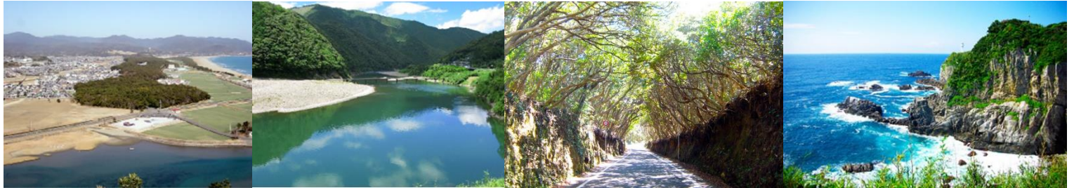
Stay Aszuri sunny side hotel 〒787-0316 Kochi pref Tosa Shimizu city Matsuo19-2 TEL: 0880-88-0331