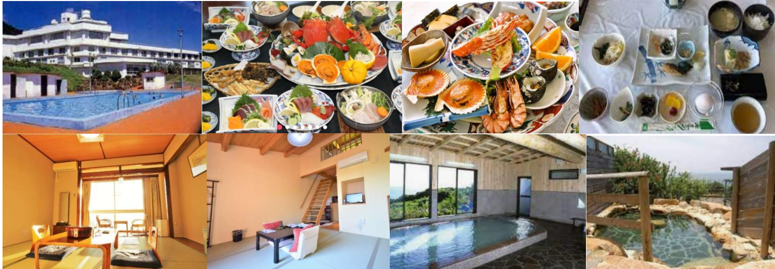
Outside dinner Cape ケープ Osteria e Pizzeria Azzurrissimo