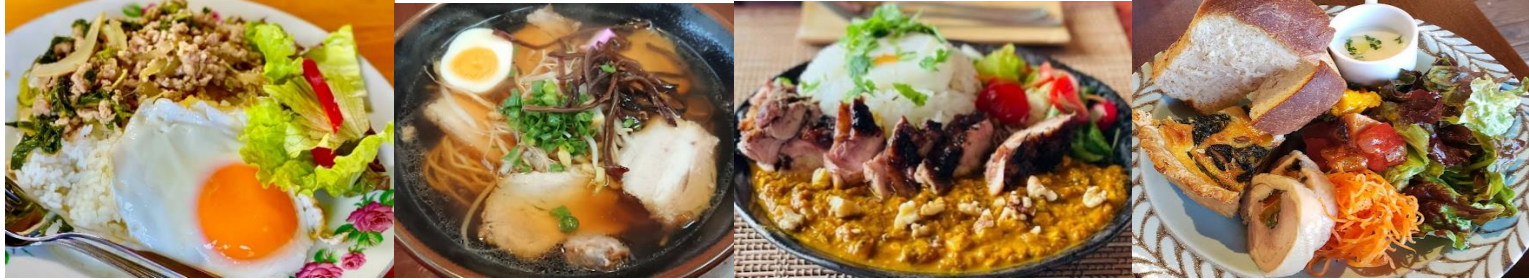
Roadside st. Bios Ogata Hinataya(63km) Tosa cuisine Seafood Yoshoku Ramen noodle