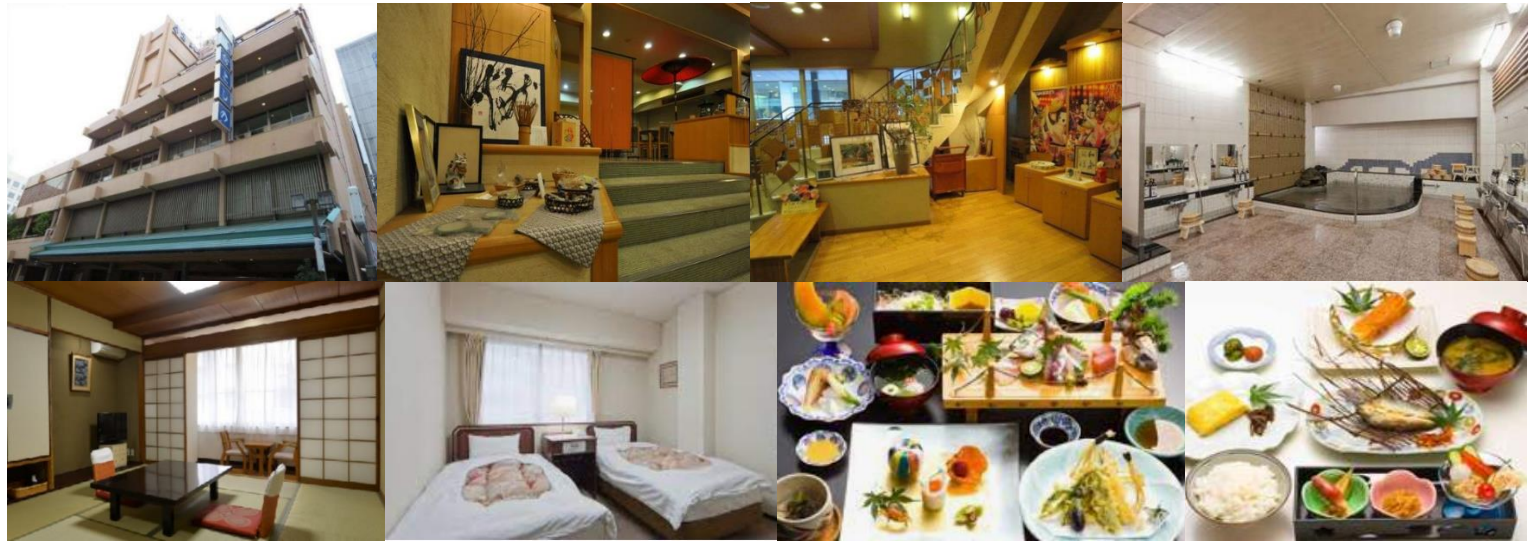
Outside dinner Yasubei Awano irodori Bizan Tokushima Sakanaichiban Shin Hanaya dining

Stay Awanokuni Subaru yado Yoshino 〒770-0833 Tokushima city Ichibangai3-18 088-654-2255