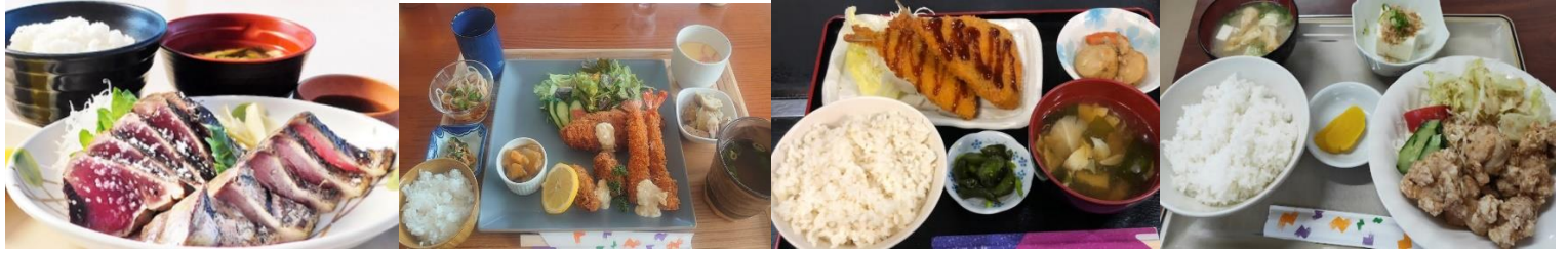
Umino Omukai st.(62km) Tawandane Thai Manmantei Curry & Jark chicken Akitsuya