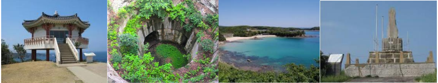
Stay: Hidasho hotel Hanakaiso 〒817-1703 Tsushima city Kamitsushima town Nishitomari390 0920-86-3120