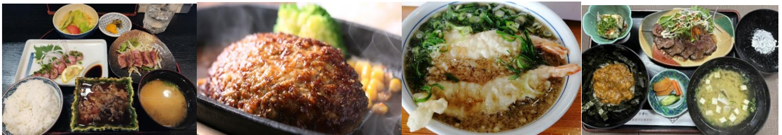
China Fukuju Mimasu sushi Iki beef Umeshima Miuraya Kamome (breakfast, holidays 7:00- need reservation weekday 11-)