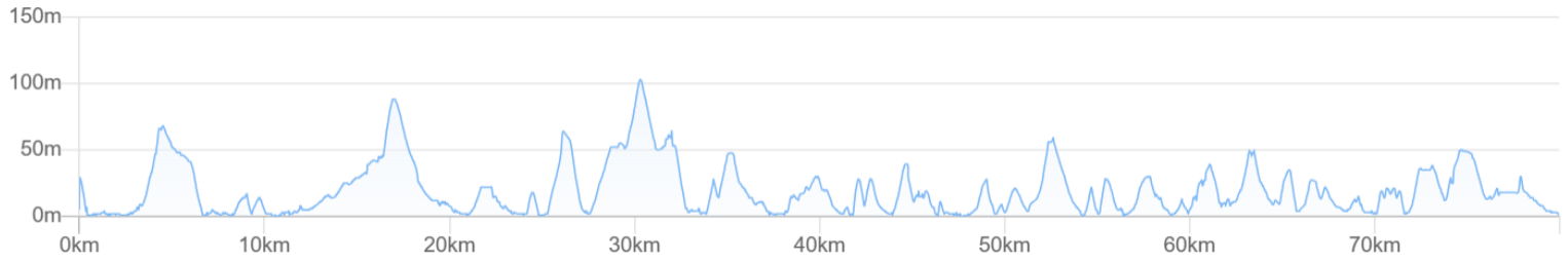
Lunch Yamaki(37km) Sea house Kichiei·Shimaderi(44km) Kitchen hirayama(47km) Tsushimatei Sato Yasuragi(60km)