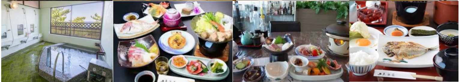
Outside dinner recommend Hidasho Minato sushi Sushi Shinichi Beef grill Wa Yae dining