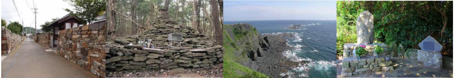
Gongen stone roof Dishukuji shrine Kaneda castle ruin Saw broken rocks Omoda beach So Sukekuni statue

Sightseeing : Stone wall street Tenpo Doshi tower Mmesuzaki cape Beauty lady grave hill