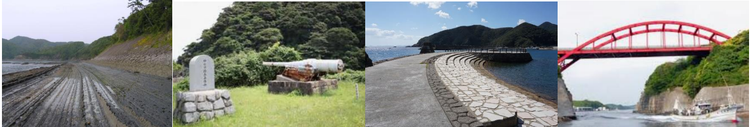
Narutaki fall nature park Kamihimeyama battery ruins Tsushima stone roof Tsushima fortress heavy artillery regiment ruins